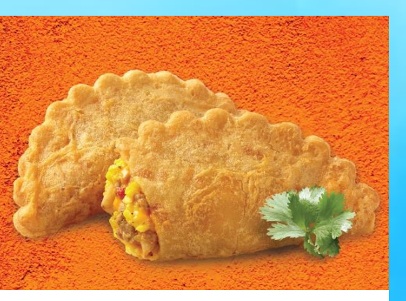
Empanada Egg, Sausage, Cheese & Potato 24/3 oz. Item # 570941

Ideal for breakfast, these empanadas are packed with the perfect filling combination of scrambled eggs, pork sausage, cheddar cheese, potatoes and green chilies. They're a proven, hot-case seller – in the A.M. or anytime of the day.