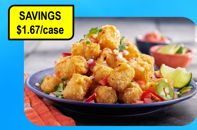
Tater Puffs 6/5# Item # 421318

The Waffled Hash Brown is made from real shredded potatoes and baked to crispy perfection. Excellent as a side, a build, topped and loaded, or on-the-go.